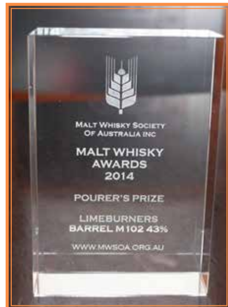
Trophy Winners: Best Australian Malt Whisky – Lark LD473 Port Cask 58% Best Non-Australian Malt Whisky – Glenfarclas 30 43% The Pourer's Prize – Limeburners Barrel M102 43%